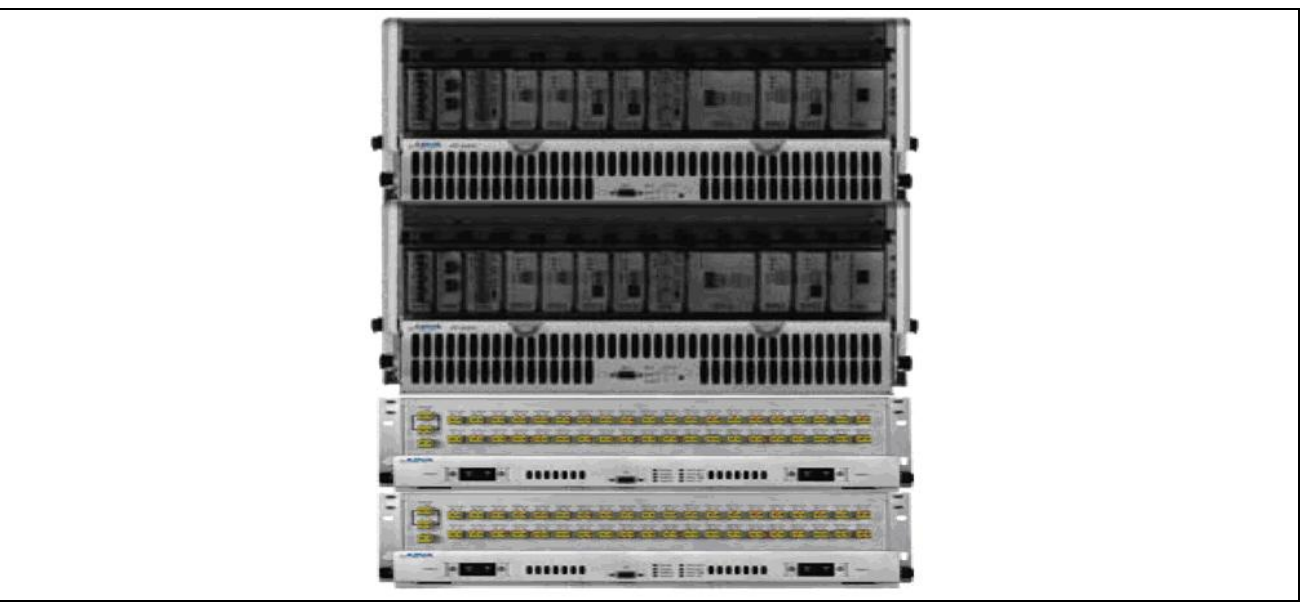
Figure 1 – ADVA FSP 3000RE-II device has Lambda Switching Capability (LSC).

For detail evaluation of the ADVA devices features in context of PHOSPHORUS project requirements, there will prepared some tests. These tests will verify 40Gbps and 100Gbps transmission system capabilities, measure the add/drop and pass-through setup time with automatic laser equalization and also evaluate the management/configuration devices interfaces. These tests are very important for PHOSPHORUS WP2 and WP6 activities which will preparing TNRC SP controller (detail requirements of TNRC SP controller are available in PHOSPHORUS-D2.3) for ADVA device.