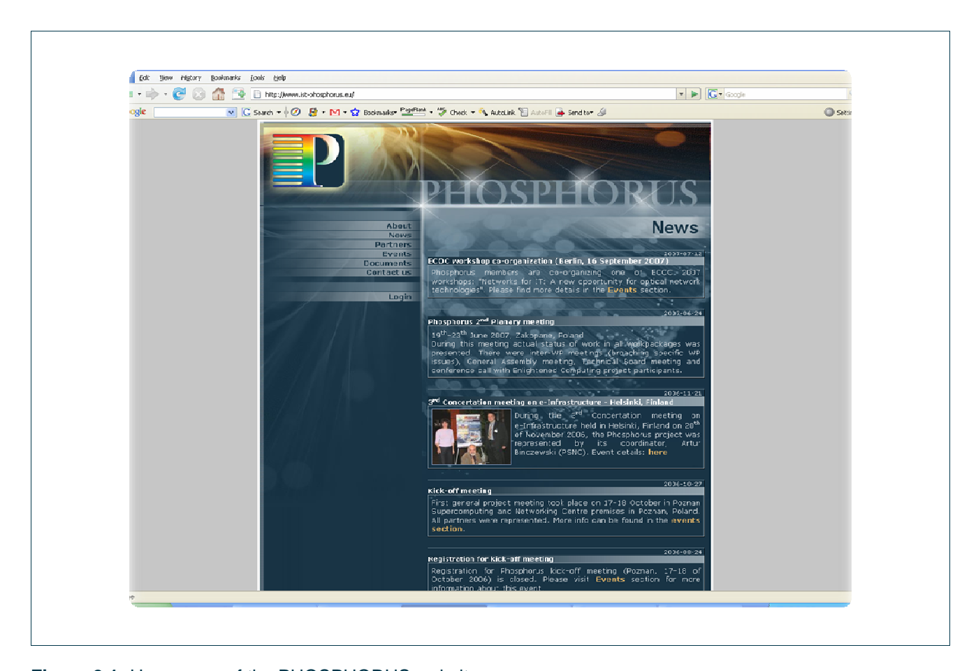
Figure 2.1: Homepage of the PHOSPHORUS website

A website was developed to act as a platform for public outputs such as publications, public deliverables, and public standardisation drafts. It is the main means for dissemination to the general public. The website presents a brief summary of the PHOSPHORUS project, all events that have taken place since the start of the project, a news section and a comprehensive contact details list of all partners involved in the project. The final structure of the website is detailed below along with a short description for each section and audience targeted.