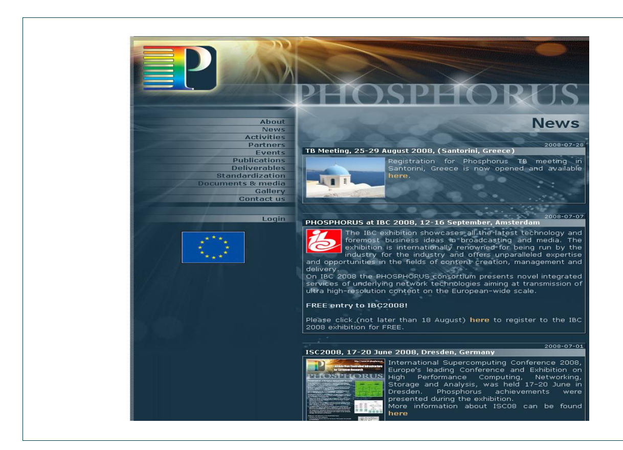
Figure 2.1: Screenshot of the PHOSPHORUS website

The website can be accessed through <a href="http://www.ist-phosphorus.eu">http://www.ist-phosphorus.eu</a>